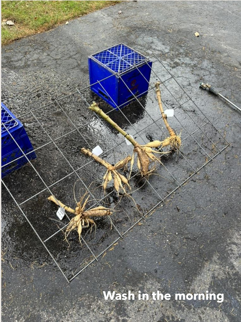
Wash in the morning