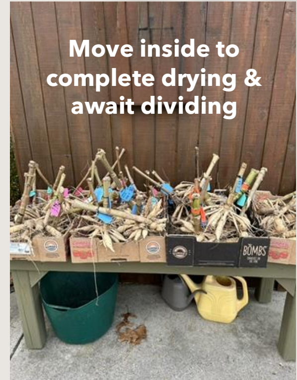
Move inside to complete drying & await dividing