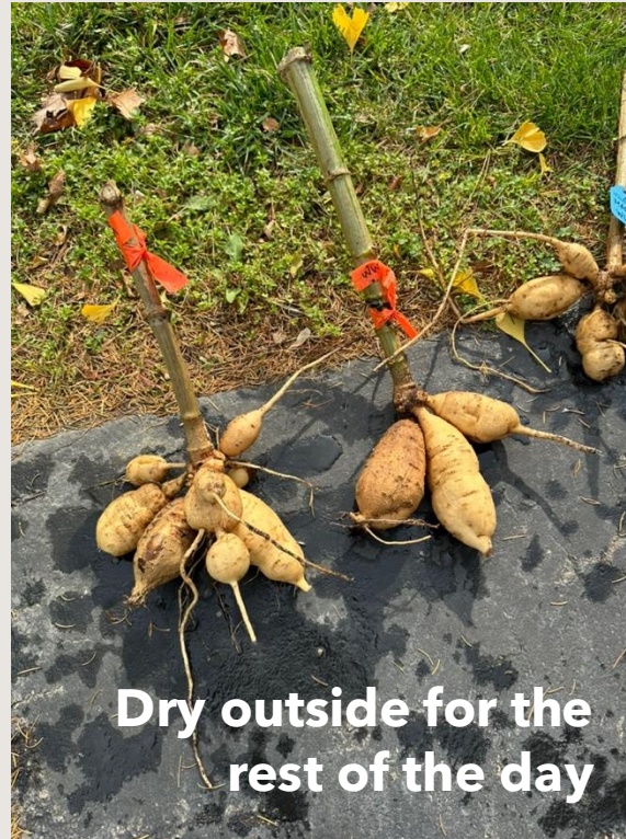
Dry outside for the rest of the day