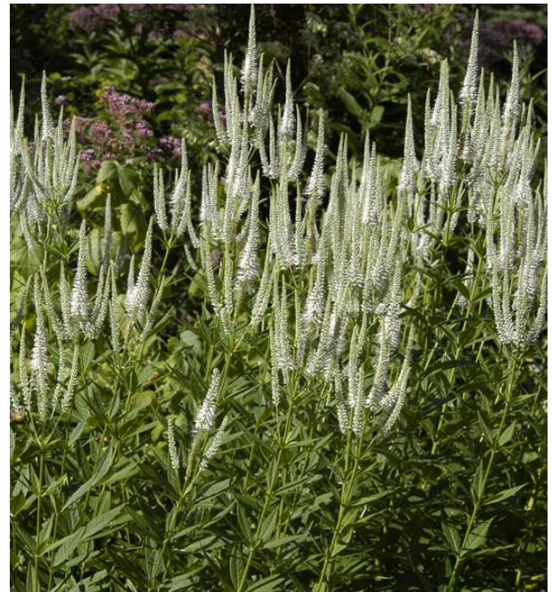
Veronicastrum virginicum (Culver's Root) 1 H: 4 to 7 feet, June to August