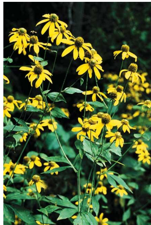
Rudbeckia laciniata (Green Headed Cone flower) H: 3 to 9 feet, July - September