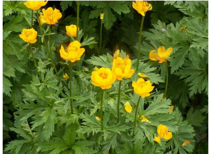
Trollius X cultorum (Globeflower) H: 2 to 3 feet, May, June