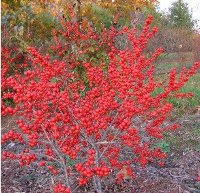
Ilex verticillata 'Red Sprite' (Winterberry)

H: 3 to 5 feet, red berries late summer, fall and winter. Needs a male for pollination