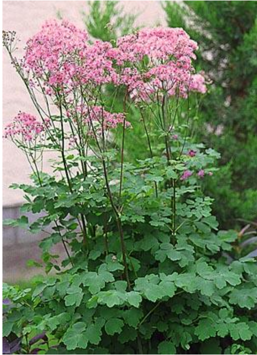
Thalictrum rochebruneum (Lavender Mist Meadow Rue) H: 6 to 8 feet, July - September