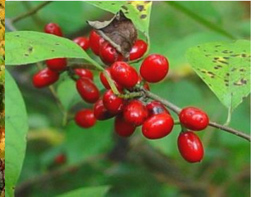
Lindera benzoin (spicebush)

H: 6 to 12 feet, March, fruit, fall color