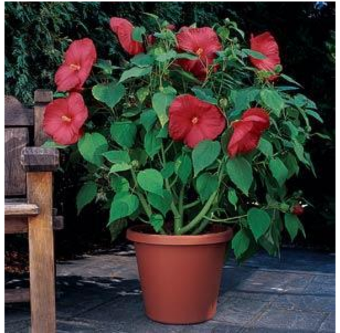
Hibiscus moscheutos 'Luna Red'(Hardy Hibiscus)