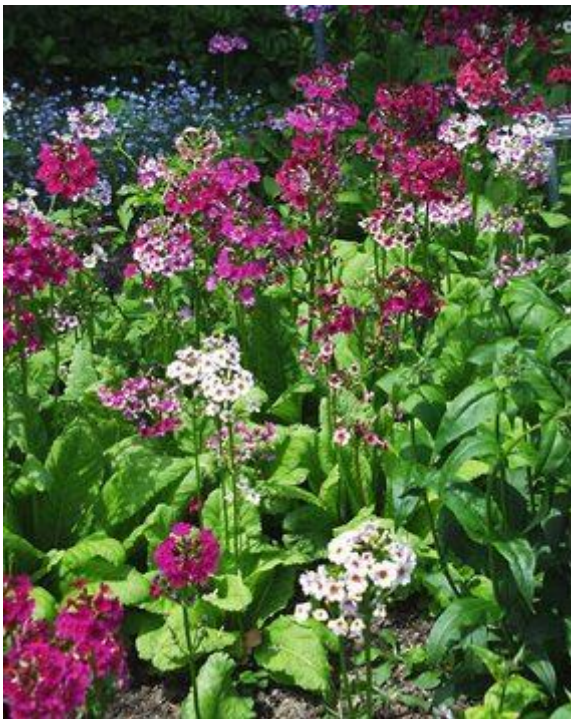
Primula japonica (Japanese Primrose) H: 12 to 18 inches, Late spring, early summer