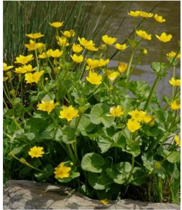
Caltha palustris (Marsh Marigold) H: 10 to 12 inches, Early spring