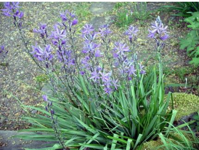
Camassia leichtlinii (Indian Hyacinth) H: 3 feet, April, May