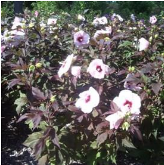
Hibiscus moscheutos 'Kopper King' (Hardy Hibiscus)