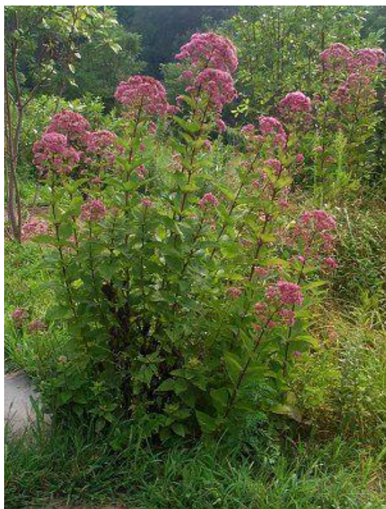
Eupatorium 'Little Joe' (Joe Pye Weed) H: 3 to 4 feet, July-Sept