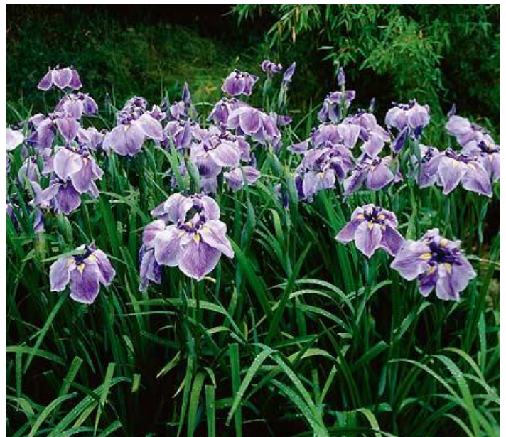
Iris ensata (Japanese Iris)