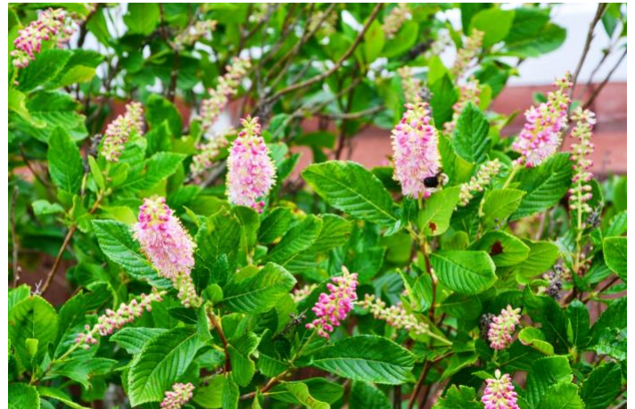
Clethra alnifolia 'Ruby Spice' (Summersweet)

H: 3 to 6 feet, May, fruit and fall foliage color