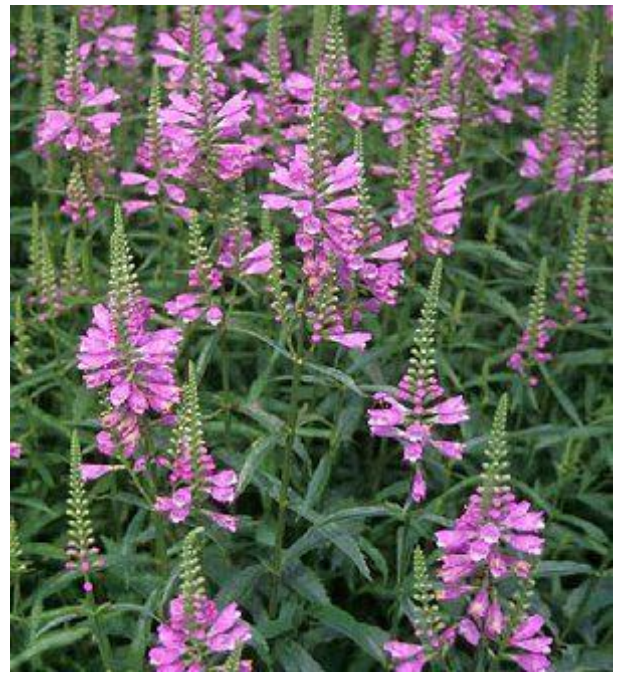
Physostegia virginiana (Obedient Plant) H: 3 to 4 feet, July-September, can be aggressive