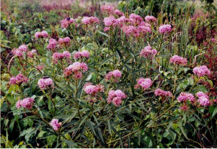
Asclepias incarnata (Swamp Milkweed) H: 4 feet, July, August