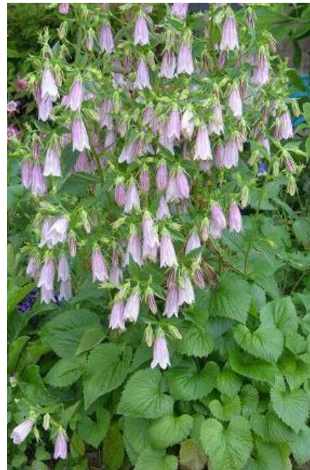
Campanula takesimana (Korean Bellflower) H: 1.5 to 2 feet, July, August