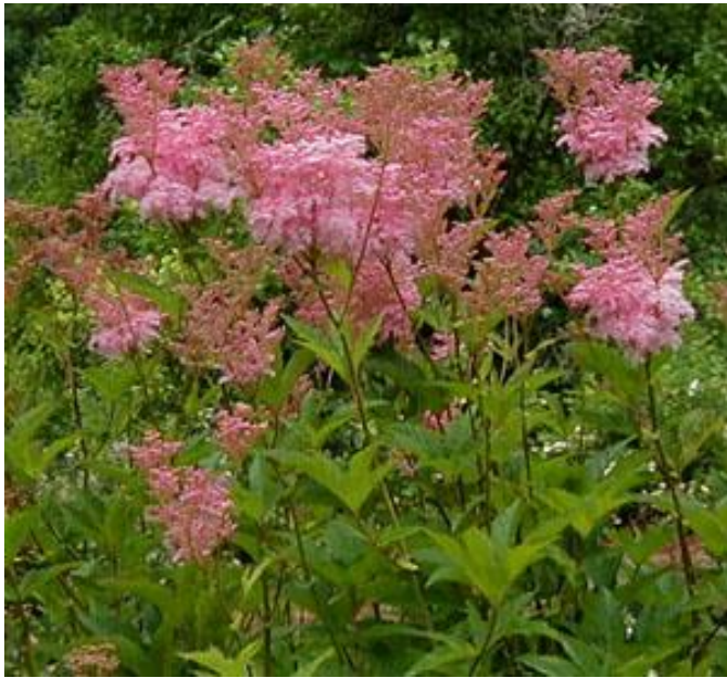
Filipendula rubra (Queen of the Prairie)"