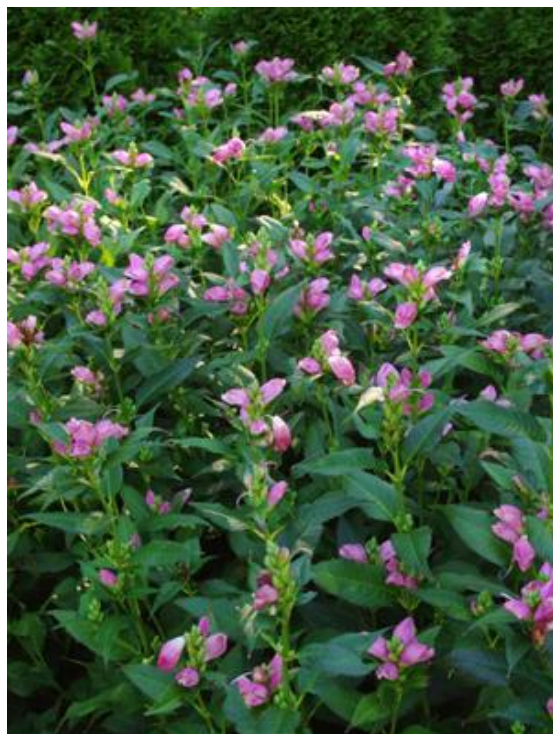
Chelone lyonii (Pink Turtle-Head) H: 2 to 4 feet, July-September