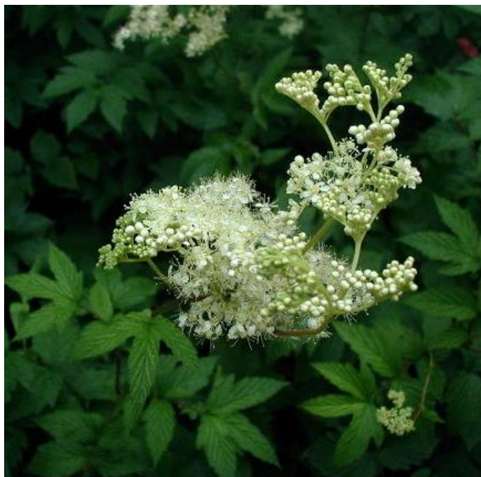
Filipendula ulmaria (Meadowsweet) H: 3 to 6 feet, June-August