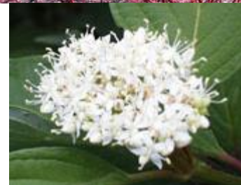
Cornus sericea 'Baileyi' (Red Osier Dogwood)

H: 6 to 10, May, June, Red stems in winter