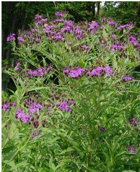
Vernonia noveboracensis (Ironweed) H: 4 to 6 feet, August, September