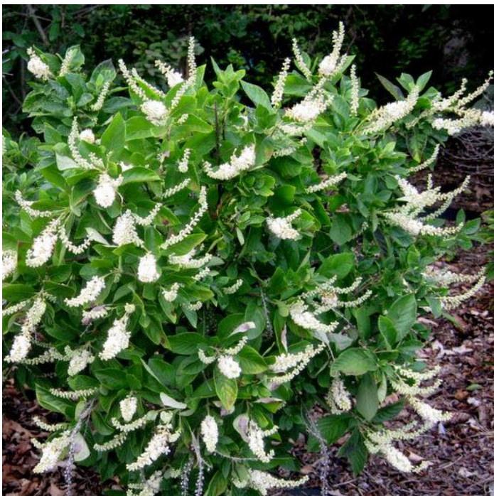
Clethra alnifolia 'Hummingbird'

H: 4 to 6 feet, July – August, fall color