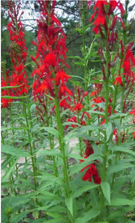
Lobelia cardinalis (Cardinal Flower) H: 2 to 4 feet, July to September