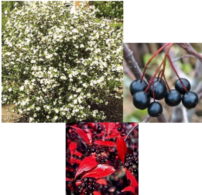
Aronia melanocarpa (Chokeberry)

H: 3 to 6 feet, May, fruit and fall foliage color