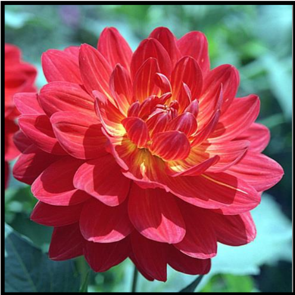
Red Velvet 7306 “73” - Waterlily “06” - Red