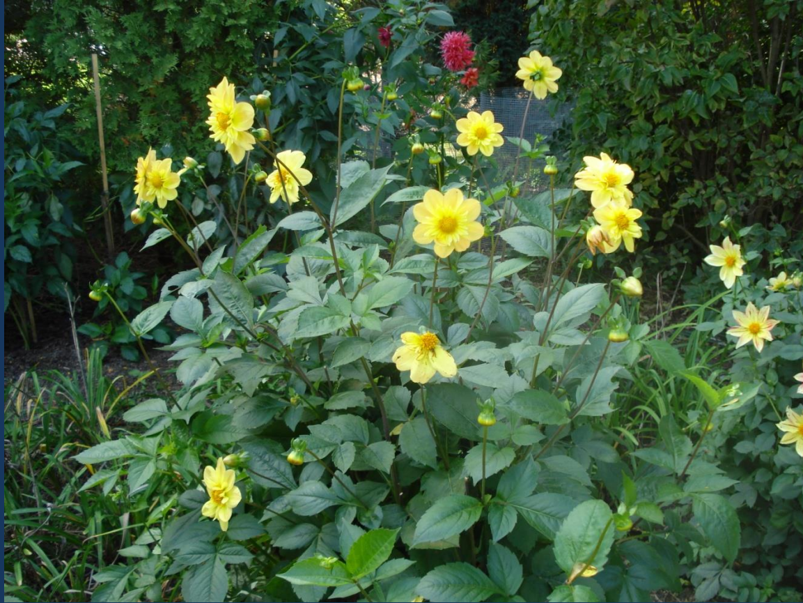
Andrea's Collaret Dahlia