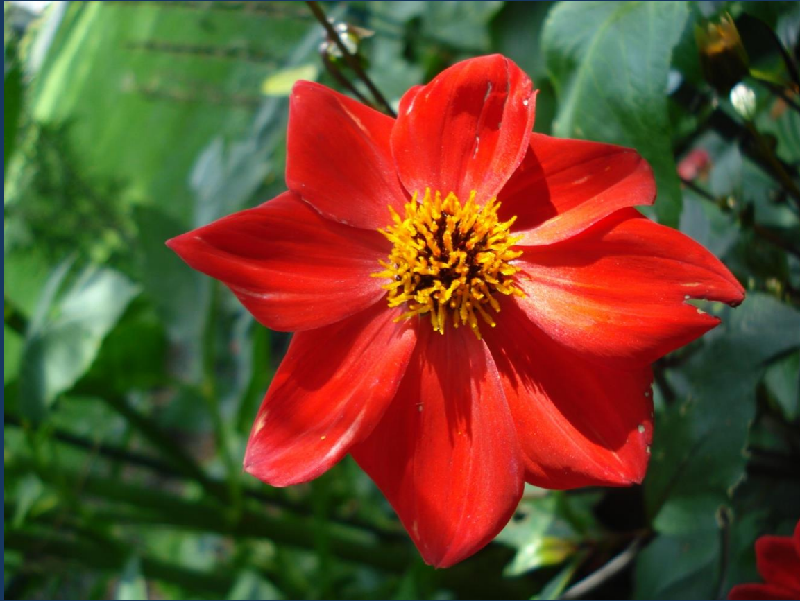
Al VanHouttee's Red