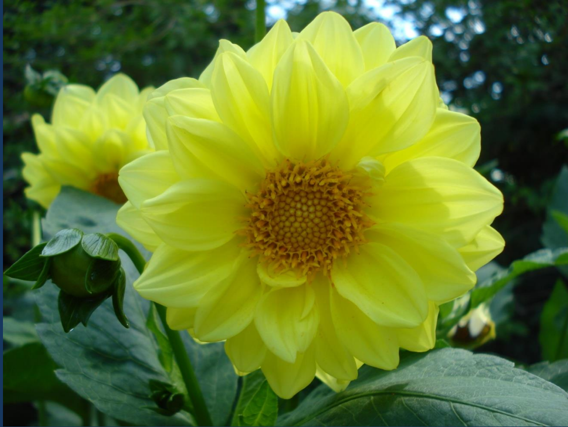
Al VanHouttee's Yellow