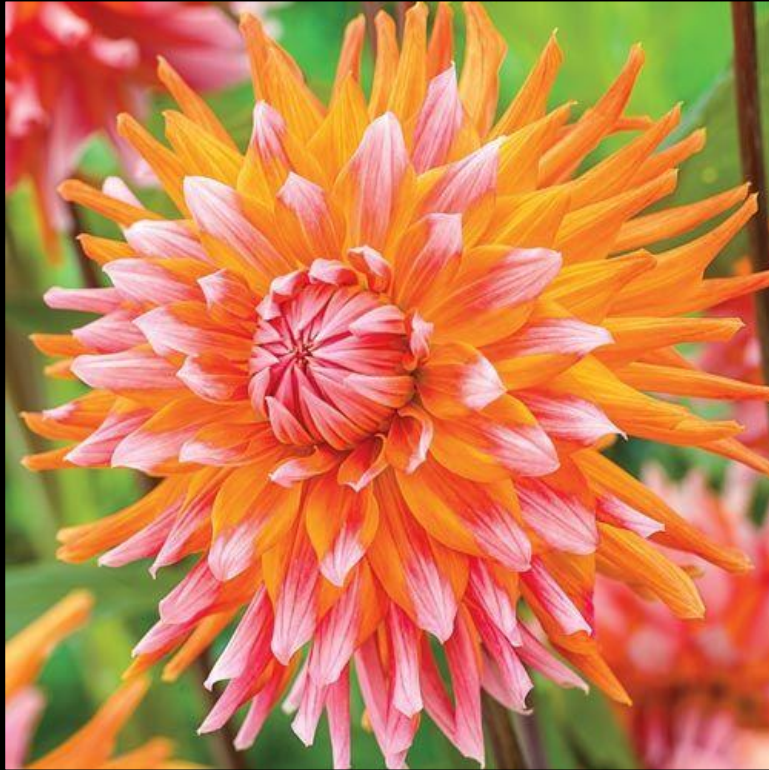
Orange Turmoil Purchased from Menards