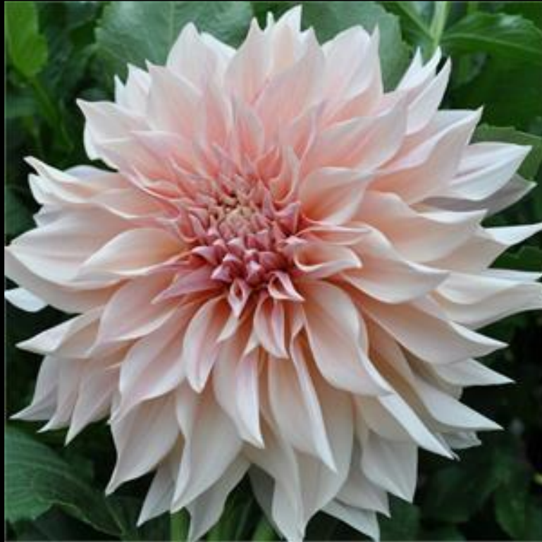
Café au Lait